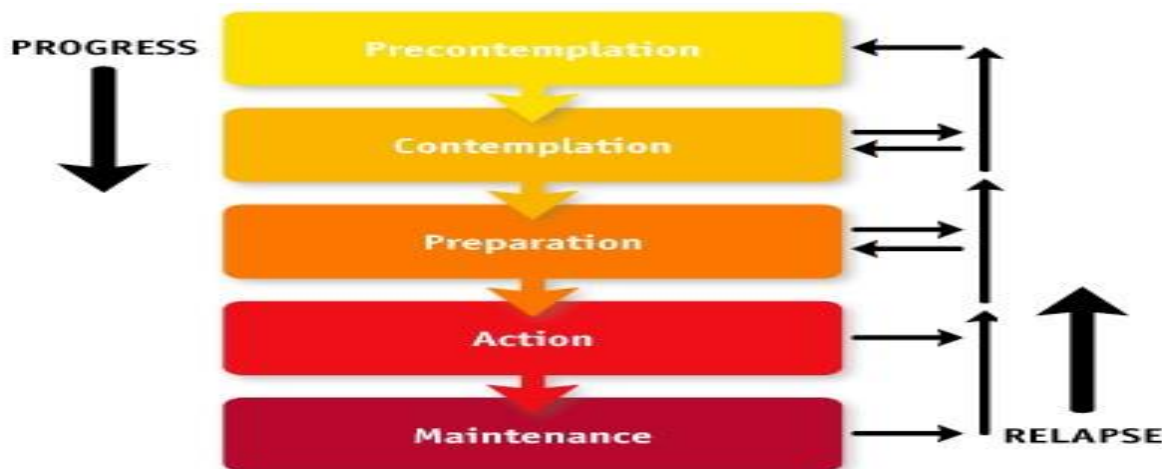
Figure: The Transtheoretical model (Prochaska and DiClemente, 1983)

contemplation, preparation, action, maintenance, and termination (see Figure ). Multiple psychoanalytic psychotherapies can be applicable to Social Media Addiction. However much research is needed to clearly apply any of said therapies. There is no clinical avoidance as of yet, of pharmaceutical effectiveness for Social Media Addiction.