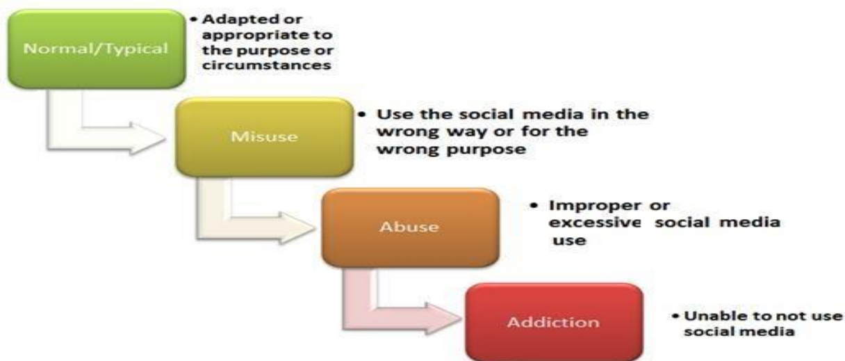
Figure 2: From Normal to Addiction Stages

communication devises and devoting cumulative amount of time accessing social networks, and the activity users get engage in above all others to produce pleasurable effect. We have identified four stages that lead to Social Media Addiction (1)Normal